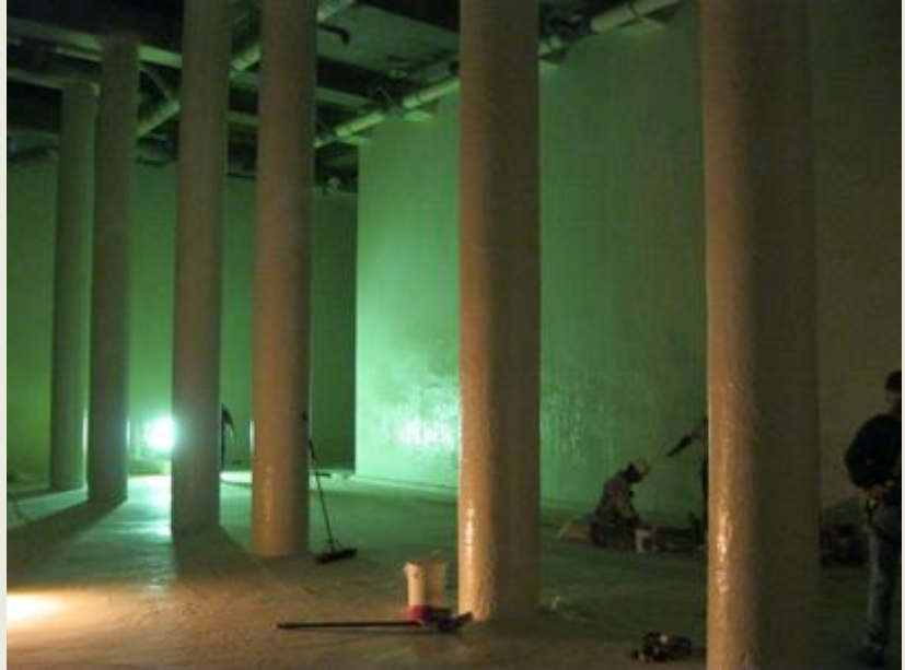
The Ecosystem® process saved CSULB from costly concrete resurfacing.

When no other lining can create a pinhole-free surface over severely degraded concrete or heavily corroded steel, elastomeric polyurethane may be the cost-effective solution that eliminates a maintenance headache once and for all. Elastomeric polyurethane can be applied at virtually any thickness over almost any substrate to create a pinhole-free lining that will stay that way for more than 30 years.