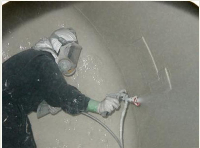
Goodwest employee relining a severely corroded water filtration pressure vessel with thick film of elastomeric polyurethane.

Ten years ago Goodwest Linings & Coatings decided to try something that had not been attempted before on the west coast – lining water filtration pressure vessels with elastomeric polyurethane. More than three hundred filtration vessels later, the verdict is in: elastomeric polyurethane linings ensure long-term, maintenance-free corrosion protection of vessels and significantly extend the lifespan of water filtration systems.